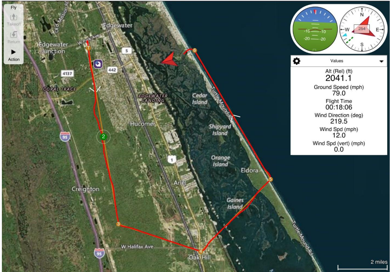
Tracks and waypoints on QGroundControl App during a NAV mission. (Tune with NAV L1 Parameter)